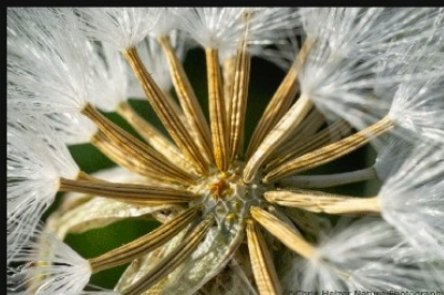
Prairie dandelion seeds ( Nothocalais cuspidata ).

I've been seeing a lot of brand new plants germinating from seeds during the last couple weeks. Looking at all those cotyledons (first leaves) poking out of the ground makes me reflect on the massive amount of good fortune it takes for any seed to actually turn into a new prairie plant.