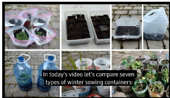
In today's video let's compare seven types of winter sowing containers:

And watch this comparison video of different types of Winter Sowing containers! →