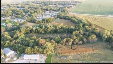
Lincoln Creek Prairie, where my square meter photography plot is located. Photographed by drone.

September has been a month of big changes within the little bit of prairie I've been photographing all year. The month started with a flush of Maximilian sunflower blossoms and lots of bees, flies, beetles, and other pollinators. Then, I went to Illinois for a few days. When I got back, the sunflowers were pretty much done. Pitcher sage continues to bloom, but only a few flowers are open each day and it appears to be nearly finished.