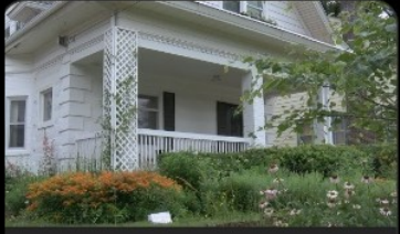
'The Flower House' in Leoss Hills Wild Ones is hosting a t...

https://www.ktiv.com/2024/06/20/flower-house-sioux-city-is-hosting-one-day-event-public/#lxnkwe8fxn449puyub