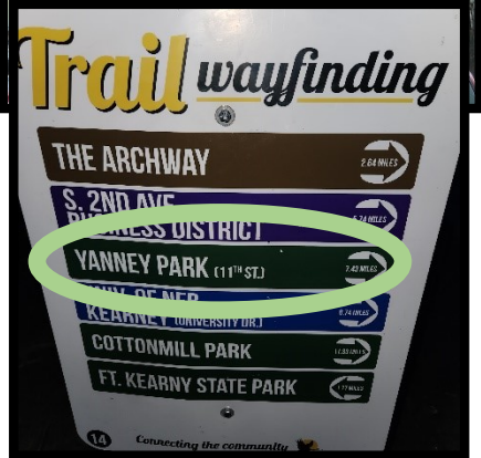
Yanney Park was on the trail map from the Hike Bike Bridge Trail!