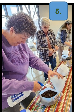
Step 5. Mist the surface with water.