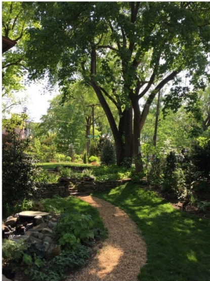
Side Garden in Year 5

This excellent Nuts for Natives Post is really worth the time to read!