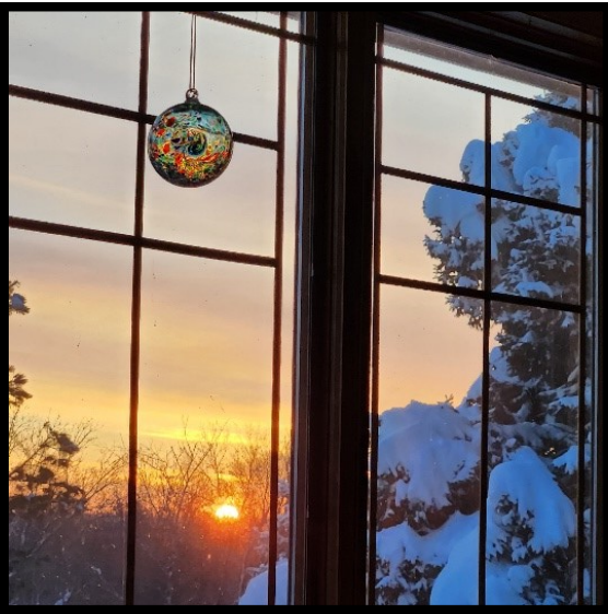
Sunset and Sun Dogs! Click photo for link!

January 17 th , 2024 What a Week of "Nature's Nourishing!"