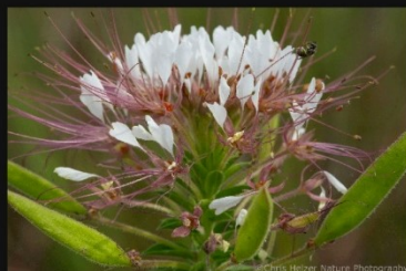
A tiny sweat bee (top right) on clammy-weed.