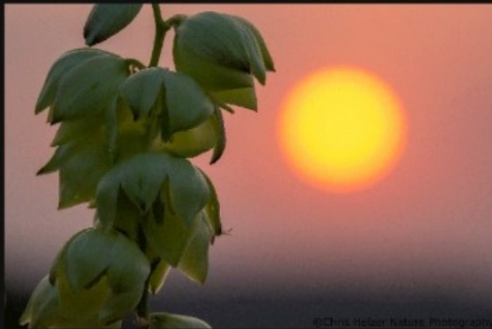
Yucca ( Yucca glauca ) flowers at sunrise - version 2. Tamron 100-400mm lens @270mm. ISO 800, f/9, 1/500 sec.

Thanks, Nature, for sharing your beauty with us! We can hardly wait to see how this turns into a beautiful and useful site for Nature! Yippeeeeeeee!!!