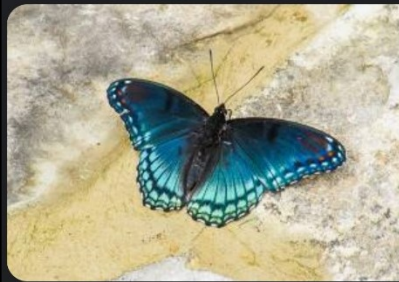
Limenitis arthemis , the red-spotted purple or white admiral, is a North American butterfly species in the cosmopolitan genus Limenitis .