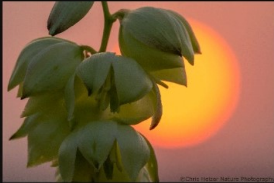
Yucca ( Yucca glauca ) flowers at sunrise - version 1. Tamron 100-400mm lens @400mm. ISO 800, f/9, 1/500 sec.

Sunday morning, I woke before sunrise and climbed a prairie ridge at the Loess Hills Wildlife Management Area. I'd scouted it the previous afternoon and knew the sun would light it up beautifully if the weather forecast held true. It did and it did.