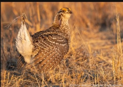
Sharp-tailed grouse. The Nature Conservancy's Niobrara Valley Preserve.

The first category is 'Best Eyebrows'. This year's winner is a sharp-tailed grouse photographed on a lek at the Niobrara Valley Preserve back in April. Look at that expression! Of course, the downside of the grouse winning this category is that it becomes ineligible for another category featured below. That's a shame.