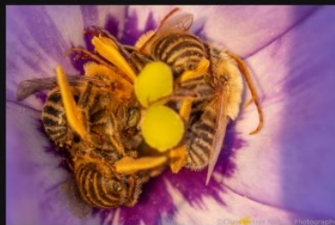
Long-horned bees ( Melissodes sp) in their overnight roost inside a prairie gentian flower ( Eustoma grandiflorum ). Nikon 105mm macro lens. ISO 500, f/16, 1/80 sec.