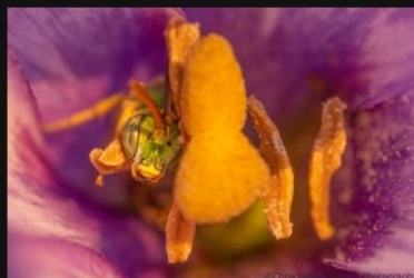
Metallic green sweat bee in its overnight roost in a prairie gentian flower ( Eustoma grandiflorum ). Nikon 105mm macro lens. ISO 500, f/16, 1/60 sec.

At 'The Wild Mess in Progress' the Obedient Plant is in full bloom and hosting some swallowtails and bees as well as many other pollinators! What an interesting and beneficial plant!