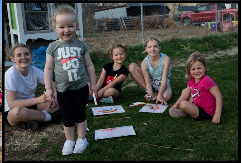
Agape Community Gardens hosted Earth Day!

The Birdie B&B hosted a robin several weeks ago, and the