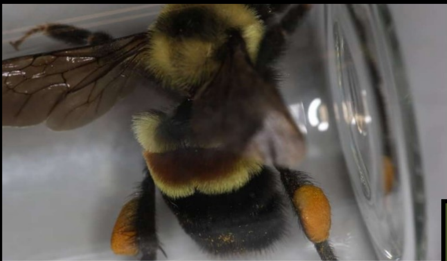
Bumbling After Bumblebees