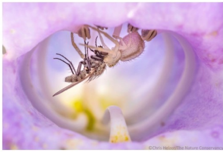
Crab spider and captured fly inside shell leaf penstemon ( Penstemon grandiflorus ). Platte River Prairies. Nikon 105mm macro lens. ISO 400, f/18, 1/100 sec.

Ok, enough of that. Here are some of my favorite prairie photos from last year. Happy New Year, everyone. Be well.