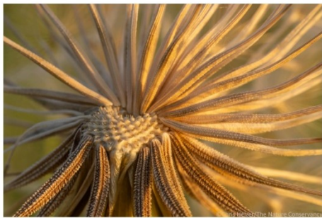
Seeds of goatsbeard, aka salsify ( Tragopogon dubius ). Platte River Prairies. Nikon 105mm macro lens. ISO 400, f/20, 1/50 sec.