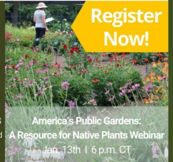
America's Public Gardens: A Resource for Native Plants Webinar Jan. 13th | 6 p.m. CT

Hurry and sign up today! Registration will close Sunday, Jan. 9th at 11:59 p.m. CT!