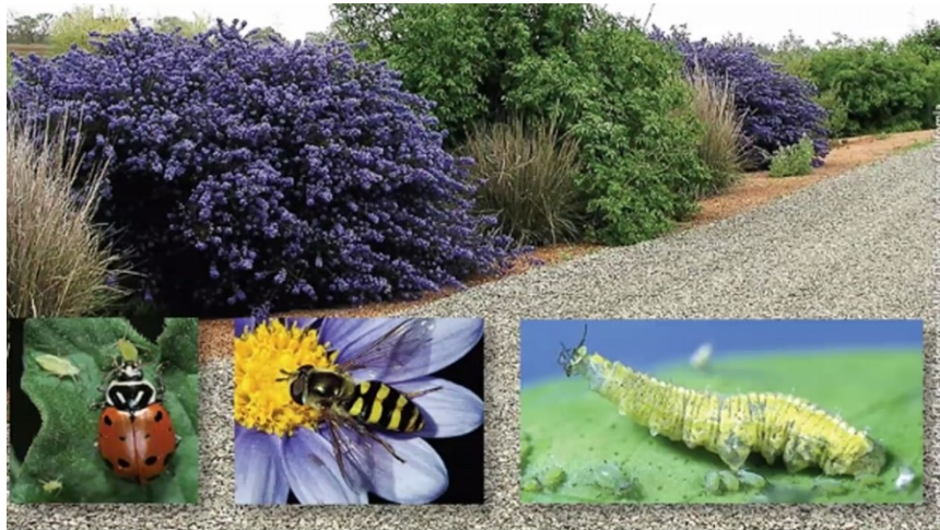
In this study, hedgerows enhanced the ratio of beneficial to pest insects compared with weedy areas. Plantings at Sierra Orchards in Solano County include deer grass, California lilac and elderberry. Inset left to right, the beneficial insects identified included lady beetles, syrphid flies and their larvae (feeding on aphids).