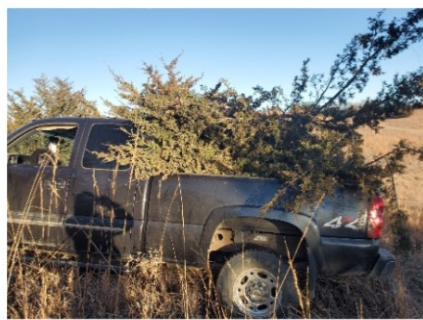
trees removed from the 'Great Green Glacier' of cedars.