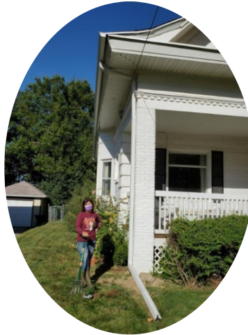
"The Flower House"