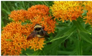
Photo: Black and gold bumble bee

Pale purple coneflower Purple prairie clover Milkweeds Ironweed Asters Rattlesnake master Goldenrods